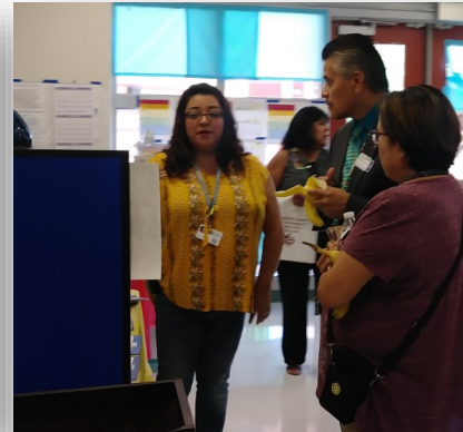
events & activities